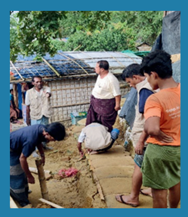
Community Group, fosters social cohesion through the restoration of a pathway

Across the nine Rohingya camps, including Camps 8E, 8W, 9, 10, 11, 12, 26, 27, and NRC, 40 Community Groups with 800 unpaid volunteers are actively working to strengthen community resilience and empowerment under the AAB Community Groups, part of the CBP initiative.