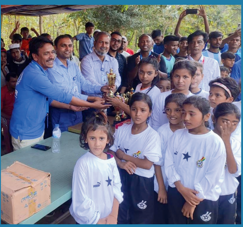
Rohingya refugee girls are enjoying a friendly football match