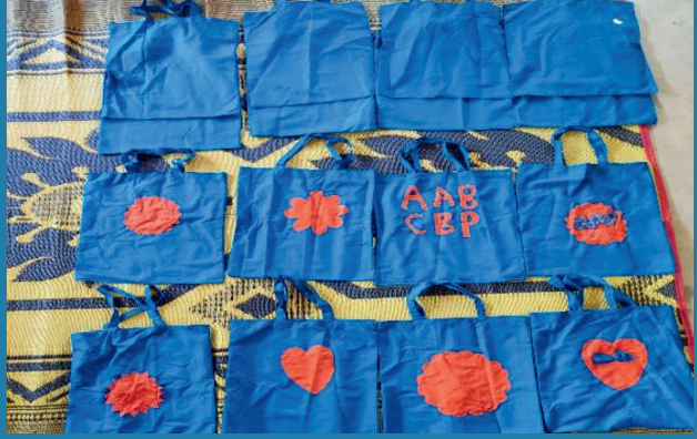
Rohingya refugee women were sewing eco-friendly bags