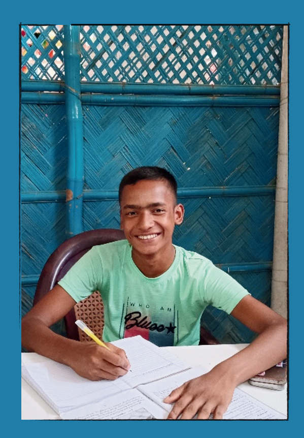
A smiling face studying in the CBP library

The library and community centre were established with a purpose — to engage adolescents, safeguard them from trafficking and illegal activities, alleviate emotional pain and trauma, build resilience, and empower the community. CBP's seven libraries across seven camps have proven successful, making significant contributions to the betterment of the Rohingya community.