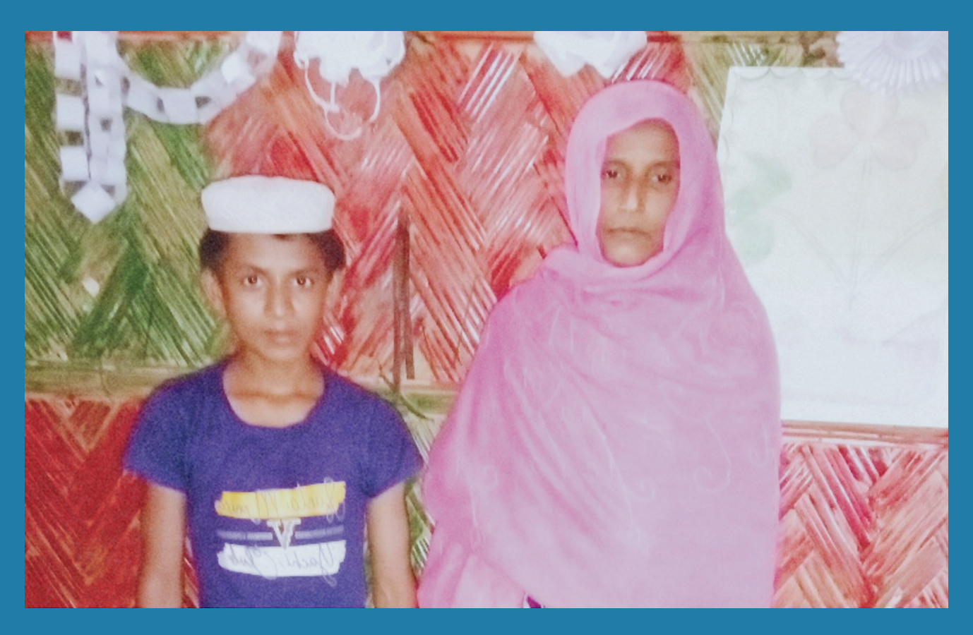
The son with his mother